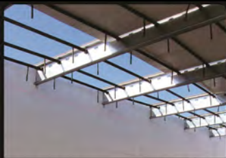
Concrete Composite Decks