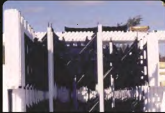
Thick Walls / H-Clip