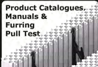
Product Catalogues, Manuals & Furring Pull Test