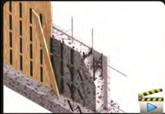
Exposed Concrete Face