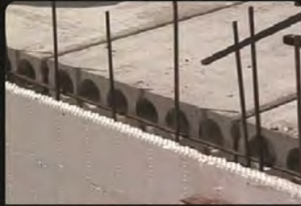
Hollow Core Floor