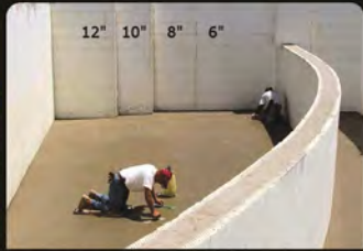
Variable Core Thickness