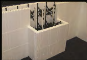
Pilasters & Columns